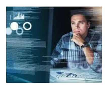
We Speak your Language

Our solutions are designed to simplify everything,putting everything you need in one place